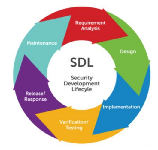
Figure 3: Dell EMC's Security Development Lifecycle