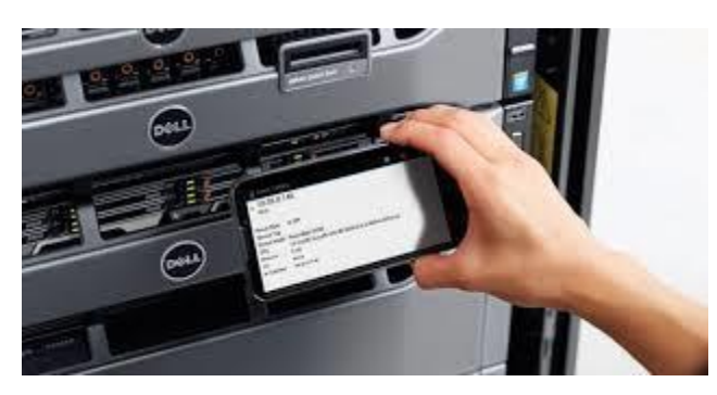
Figure 1 An administrator using iDRAC Quick Sync

Quick Sync bezels are available on selected 13<sup>th</sup> generation PowerEdge servers equipped with a Quick Sync bezel. OMM Android uses Near-Field Communication (NFC) technology to communicate with the Quick Sync bezel.