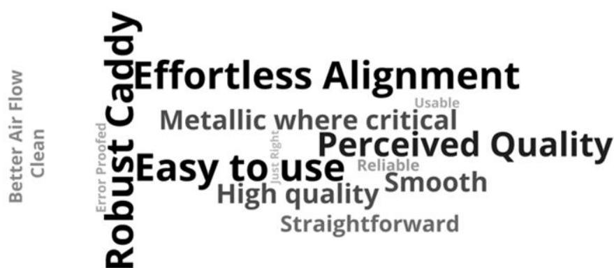
Word Cloud : IT Pros Choice of Descriptors for 14G HDD Carrier

During development, our team used analytical simulation tools as well as empirical data collection to ensure continued performance excellence in areas such as rotational vibration, structural dynamics, thermals, and ergonomics. We ran extensive focus group studies with more than seventy tenured IT professionals, garnering feedback such as: