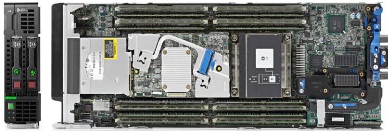
Figure 2: HPE's BL460 blade HDD and CPU layout limits airflow to the CPU due to the location of the hard drives directly in front of CPUs.