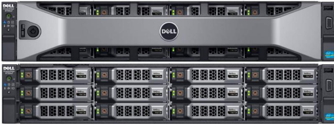
Figure 1 Dell PowerEdge R730xd 3.5-inch Server

The solution employs Dell PowerEdge R730xd server/storage combination building blocks, which are capable of meeting the high performance requirements of messaging deployments. The solution is for up to 10,000 mailboxes of size 3GB each. The following subsections describe the hardware components that are part of this Exchange solution: