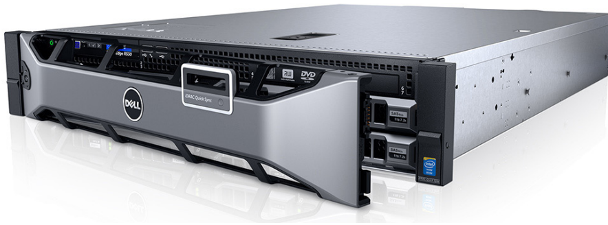
Figure 2: Quick Sync-enabled bezel