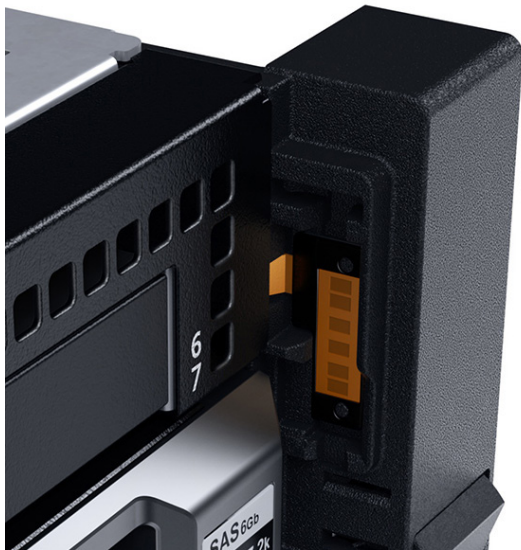
Figure 1: Quick Sync enabled rack server's "ear"

For now, Quick Sync feature is supported in 13 th generation PowerEdge R630, R730 and R730xd servers. The supported server must have the Quick Sync enabled rack ears as shown in Figure 1.