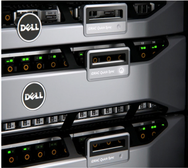
Figure 5. Activated Quick Sync

Step 2: Make sure that status LED is solid, indicating that system is ready