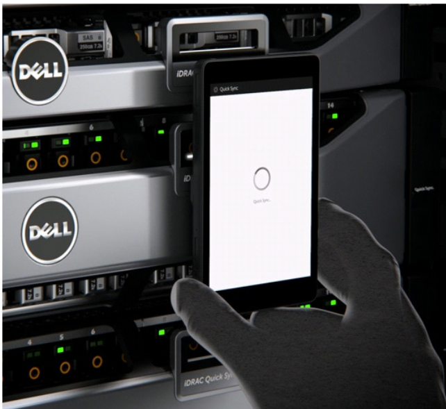
Figure 6. Tap and hold mobile device

Step 4: Tap and hold the mobile device for 2 seconds