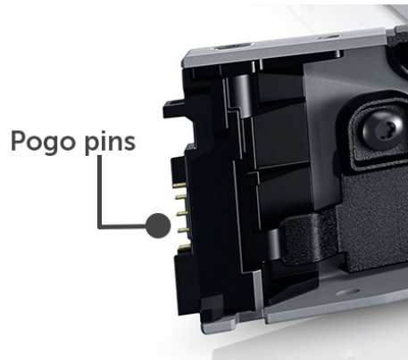
Figure 3: Close up of iDRAC Quick Sync-enabled bezel