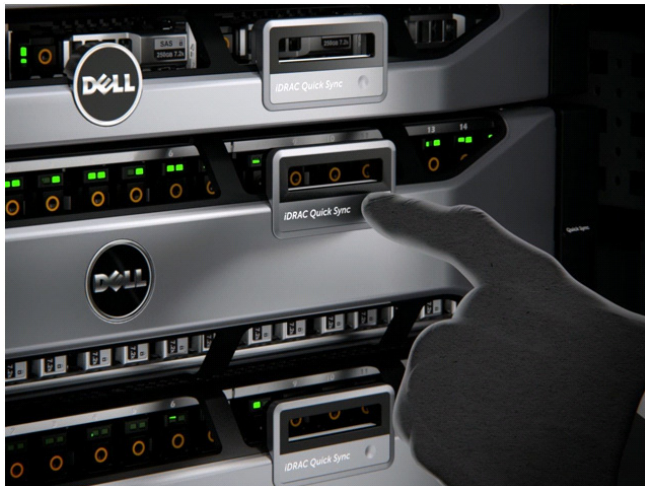
Figure 4. Activation button