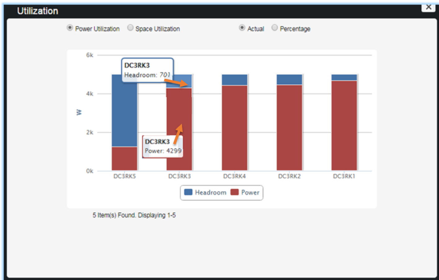
Figure 2 Rack wise power utilization graph showing used versus unused power

For example, consider that you have created a rack "DC3RK5" and allocated 5000 W (Watt) to the rack. Then by looking at the below graph you can clearly say that out of 5000 W, DC3RK3 has used 4299 W and still 701 W remaining, which can be utilized by other devices.