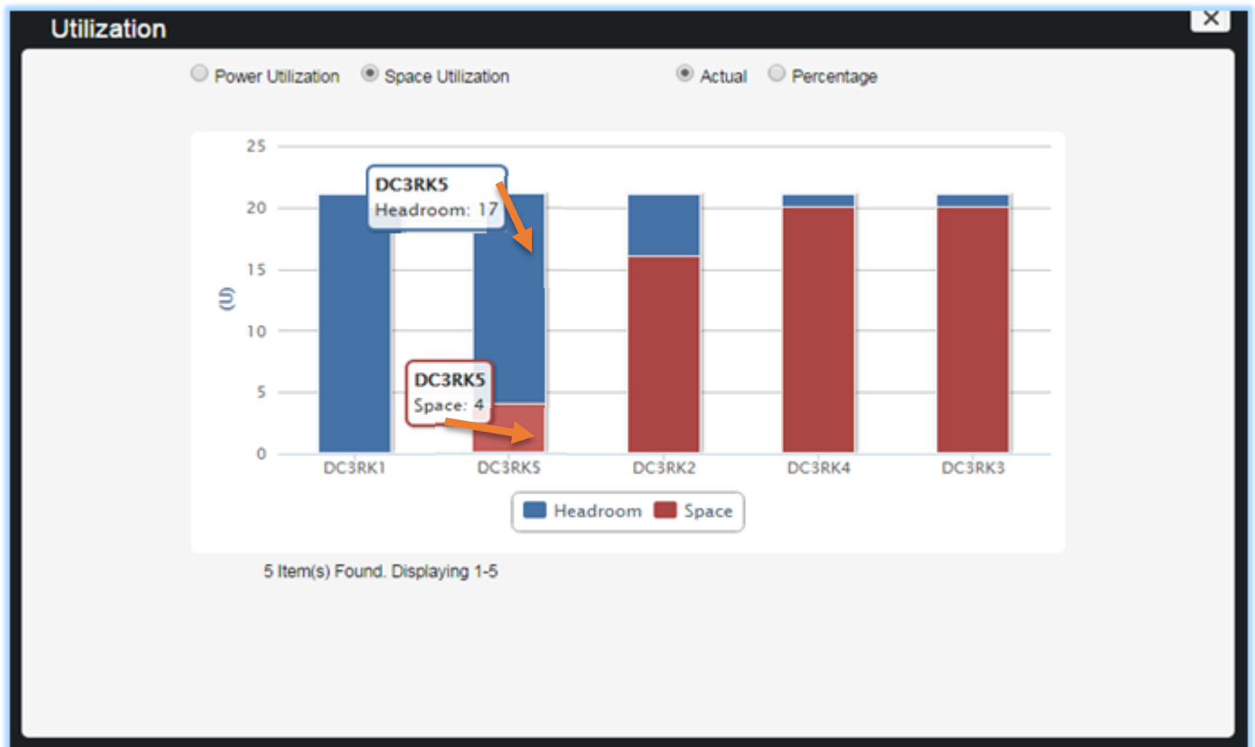
Figure 1 Rack wise space utilization graph showing used versus unused space

For example, consider a situation where you have added a rack "DC3RK5" of size 21 U and added 4 devices in the rack, each occupying 1 U of space. Then by looking at the below graph, you can clearly say that 4 U of space is being used by DC3RK5 and 17 U of space are available for use.