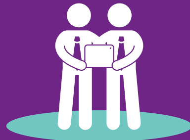
In the field

To accommodate, organizations must embrace: