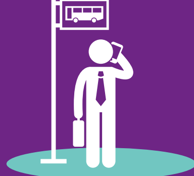
On the go